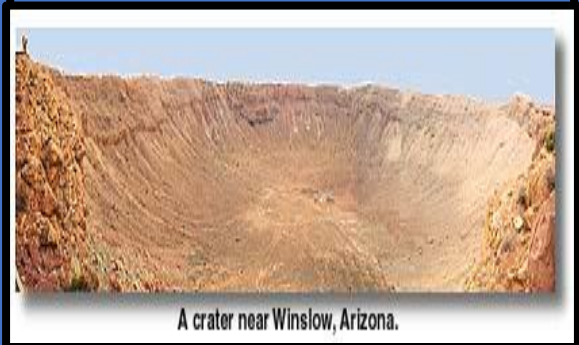
A crater near Winslow, Arizona.

How many times have you wished that you could find a way to make a little money from your 4-wheeling weekend, dirt bike, metal detector, or just walkin' across one of California's desolate dry lakes? Well, if you're observant, persistent and a little bit lucky, there may be some bucks waiting out there in the boondocks, just under your nose...and literally right out of the blue. During the past five years, there has been a rapidly increasing demand from universities and planetary scientists for freshly fallen meteorite material. The result has been an increasing cost to acquire rocks from space, which translates into big bucks for those little shooting stars you see at night. If you know what to look for, they can, literally, become dollars from heaven. (How ever, there are some rules to follow if they are found on BLM Land.)